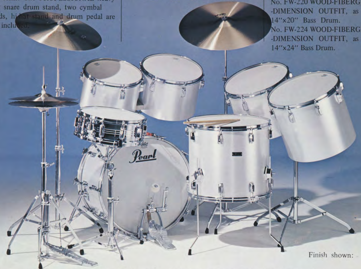
Finish shown: Satin Silver

Featuring the Pearl Custom Model 4214 Metal Snare Drum, 14"x22" Bass Drum, 16"x18" Floor Tom Tom, and FOUR-ELDER-BROTHERS Fiberglass melodic tom toms. The PROFESSIONAL heavy duty snare drum stand, two cymbal stands, hi-hat stand and drum pedal are also included.