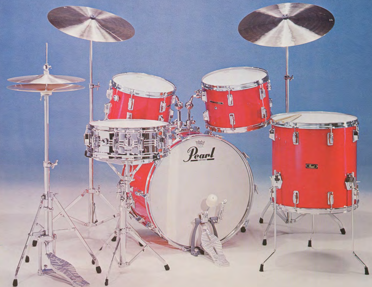
Finish shown: Red Satin

No. FW-420 WOOD-FIBERGLASS POWERMATE OUTFIT, as above with 14" x 20" Bass Drum.