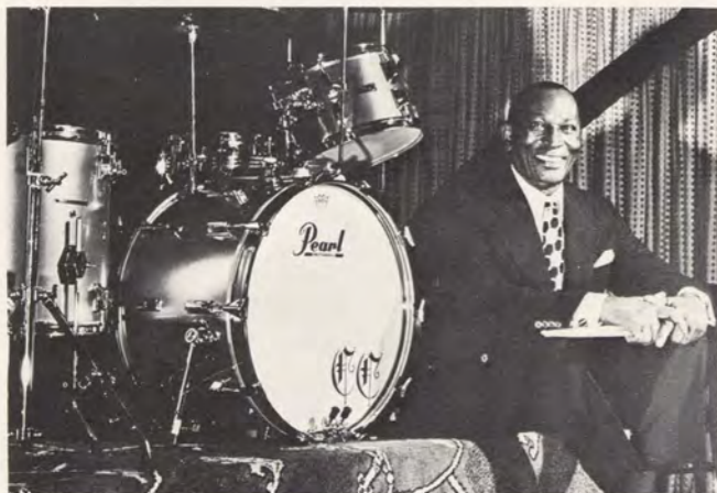
COZY COLE Prefers Pearl ... Today's Sound