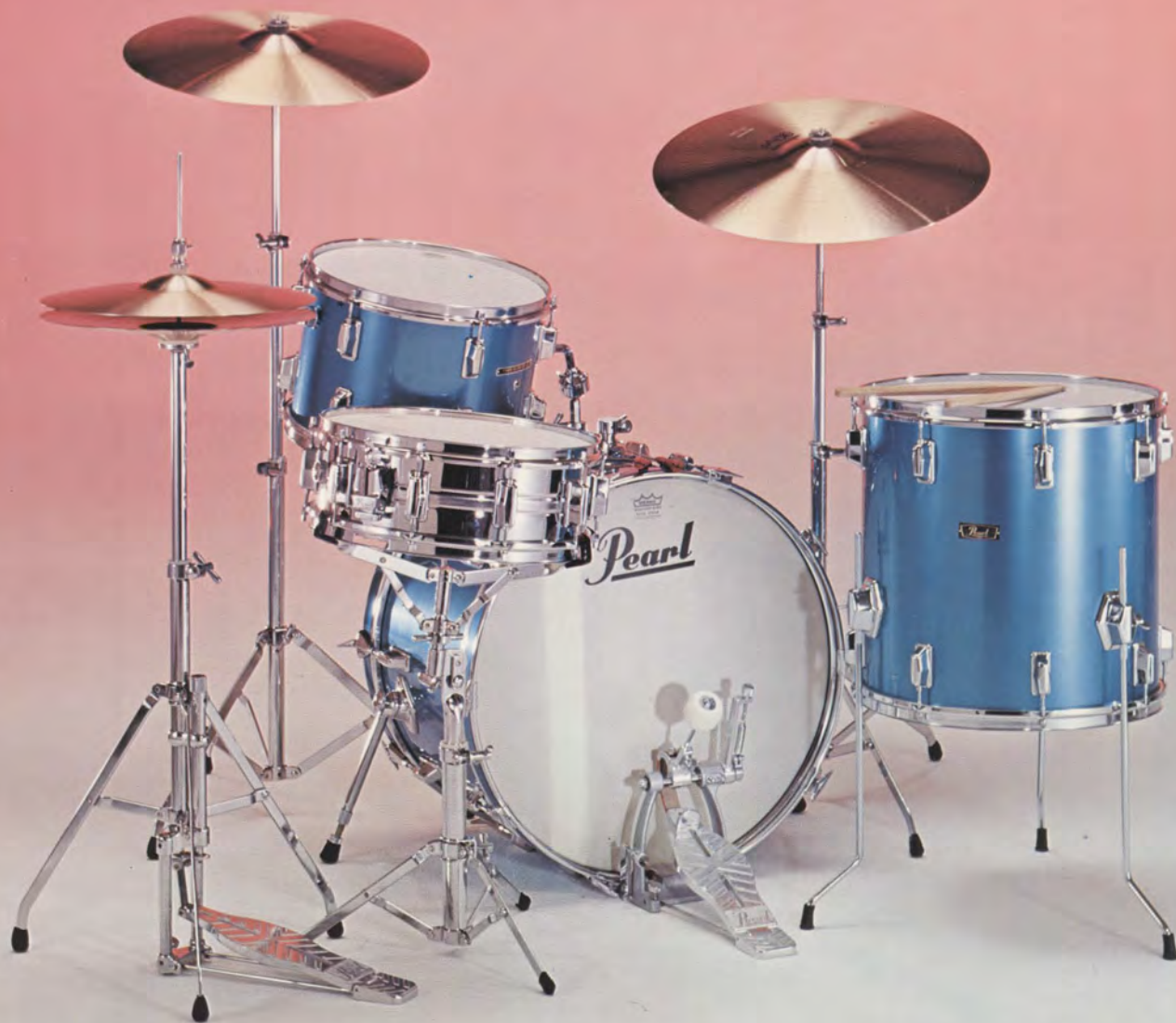
Finish shown: Satin Blue

NO. FW-520 WOOD-FIBERGLASS IMAGE-CREATER OUTFIT, as above with 14"x20" Bass Drum, 8"x12" mounted Tom Tom, 14"x14" Floor Tom Tom.