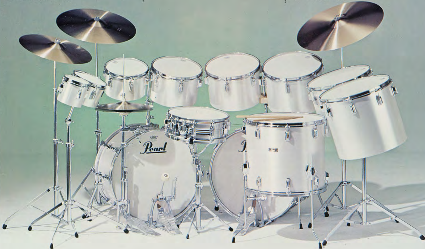
Finish shown: Satin Silver

No.FW-124 WOOD-FIBERGLASS DYNA-FAMILY OUTFIT, as above with 14"x24" Bass Drums.