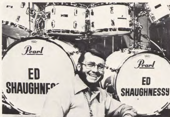
ED SHAUGHNESSY with the Tonight Show