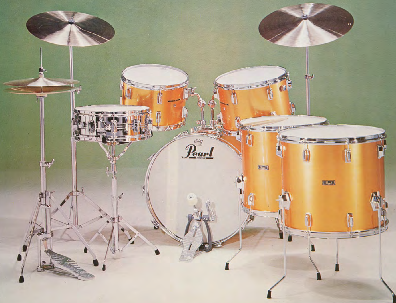
Finish shown: Gold Satin

No. FW-322 WOOD-FIBERGLASS SOUNDVENTURE OUTFIT, as above with 14"x22" Bass Drum.