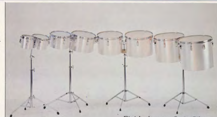
Finish shown: Satin Silver

*Available extra on Satin color finishes.