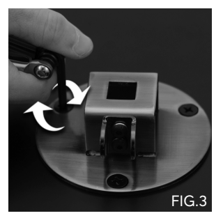
Step 3. MOUNTING BRACKET INSTALLATION - CONGA ONLY

Place the mounting bracket on the bottom of the Travel Conga and align the "Hook" vertically to the" lug" that is opposite of the logo badge, as shown (Fig.2).