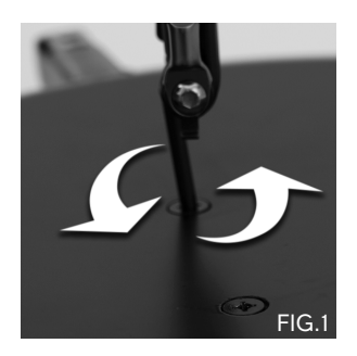
Step 1. MOUNTING BRACKET INSTALLATION - CONGA ONLY

To install the mounting bracket on the conga place the Travel Conga head-down ona secure flat surface. Using a Phillips Head screwdriver remove each of the threescrews from the bottom of the Travel Conga by turning them counter-clockwise.