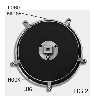
Step 2. MOUNTING BRACKET INSTALLATION - CONGA ONLY

Place the mounting bracket on the bottom of the Travel Conga and align the "Hook" vertically to the" lug" that is opposite of the logo badge, as shown (Fig.2).