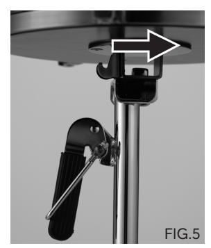
Step 5. DRUM TO STAND ATTACHMENT - CONGA & BONGOS

To mount the Travel Conga and Travel Bongos onto the stand, align the mounting bracket hook with the stand hasp.