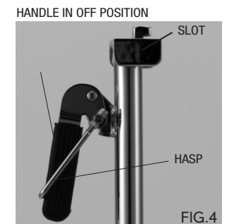
Step 4. DRUM TO STAND ATTACHMENT - CONGA & BONGOS

Attach the mounting bracket to the bottom of the Travel Conga with the three screws provided. Using a Phillips Head screwdriver, turn each screw clockwise until tight (Fig.3).